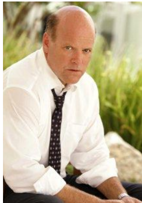
Rex Linn CSI Miami, Django Unchained